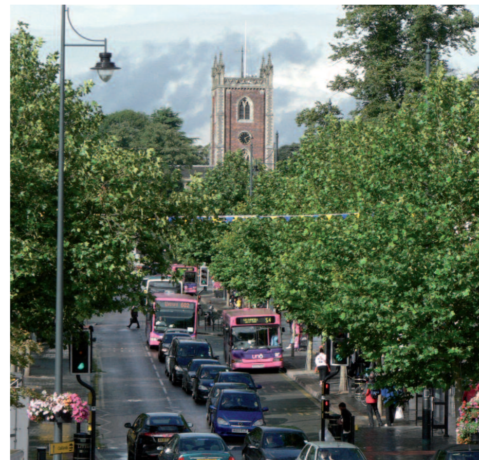
Trees in St Peter's Street - a positive result from the Society's partnership with the Council.