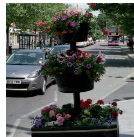
Blooming St Albans!

celebrations should take. We should like ideas from the general membership, also a few volunteers (i.e. YOU) to join this special subcommittee (see below how to register your interest).