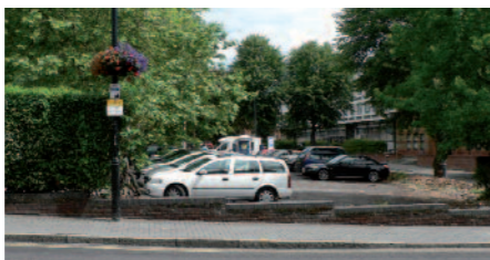
The destroyed hedge exposes the car park.