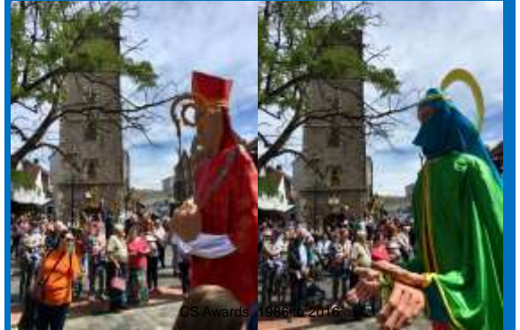
St Albans Puppets 2005