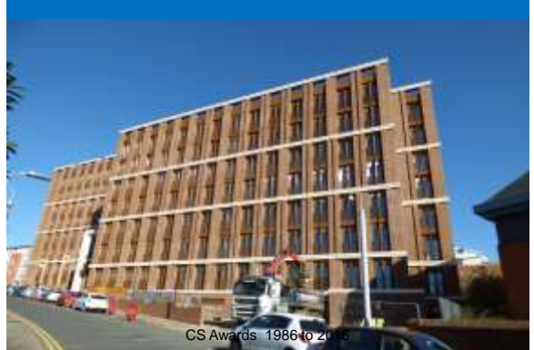
CS Awards 1986 to 2016