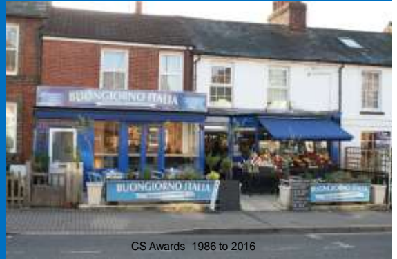
Buongiorno Italia, 68 Lattimore Rd 2011