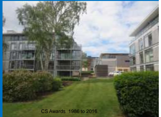
Newsom Place, Hatfield Rd 2016