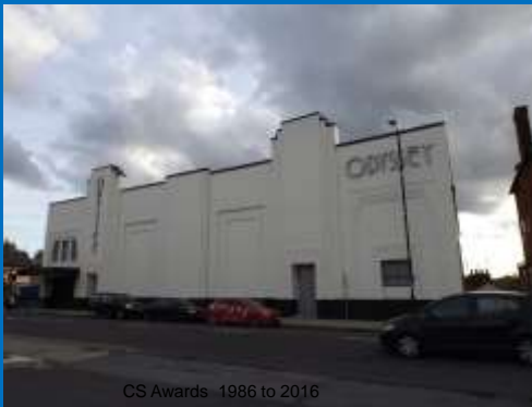
Odyssey Cinema 2014