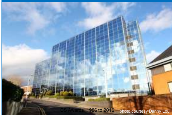
CS Awards 1986 to 2016