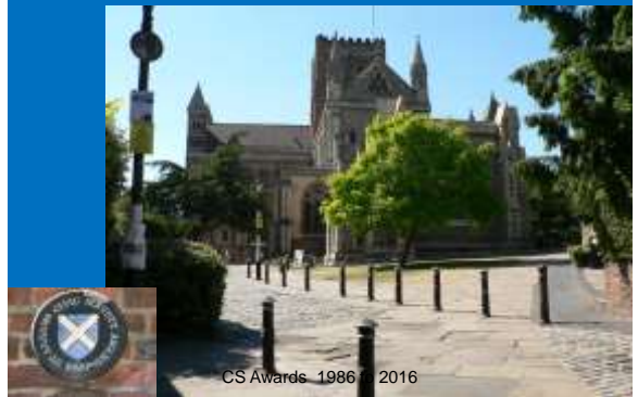
CS Awards 1986 to 2016