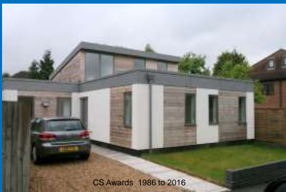
Wood House, 3a Leaf Way 2012