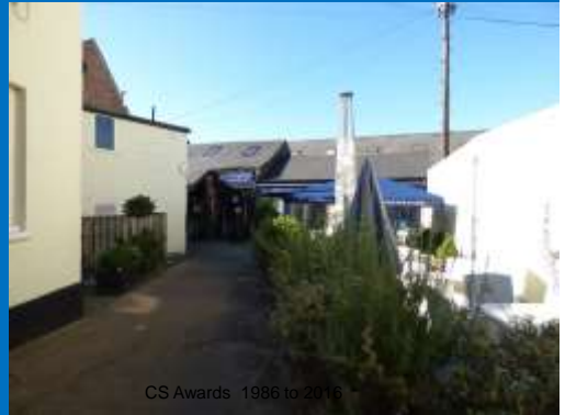
Loch Fyne restaurant, George St 2007