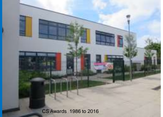
Samuel Ryder Academy 2013