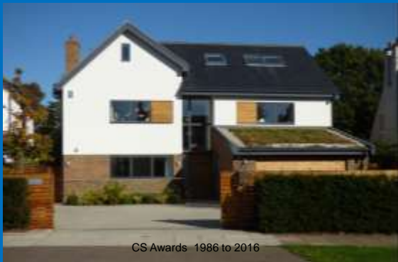
65 Marshal's Drive 2006