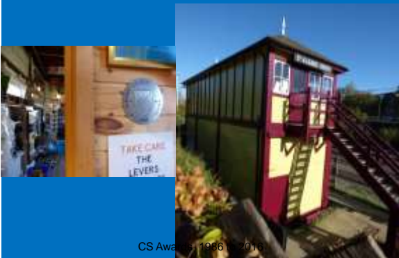
Signal Box at station 2008