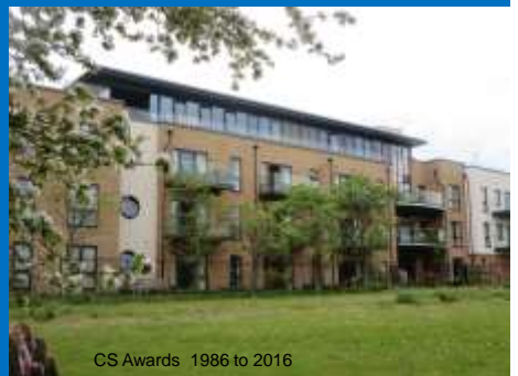
Parkside View flexicare housing, Marshalswick 2015