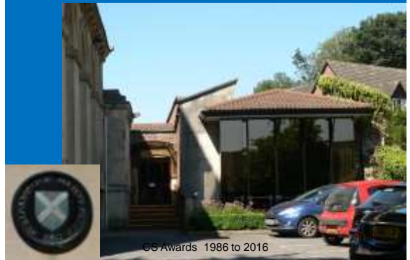
CS Awards 1986 to 2016