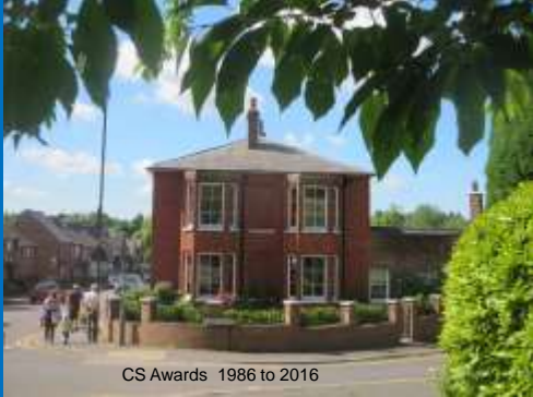
CS Awards 1986 to 2016