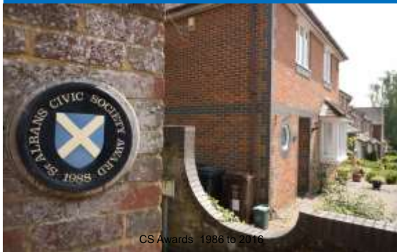
CS Awards 1986 to 2016