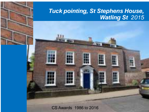
Tuck pointing, St Stephens House, Watling St 2015