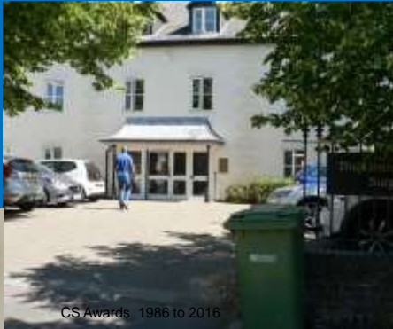
Grange Street Surgeries 1991