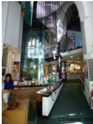
Trestle Arts Base 2003