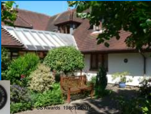
Grove House 1994 (form. Macmillan Runcie Hospice)