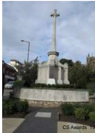
War memorials 2014