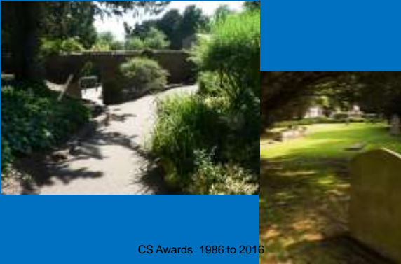
Vintry Garden and Romeland 2004